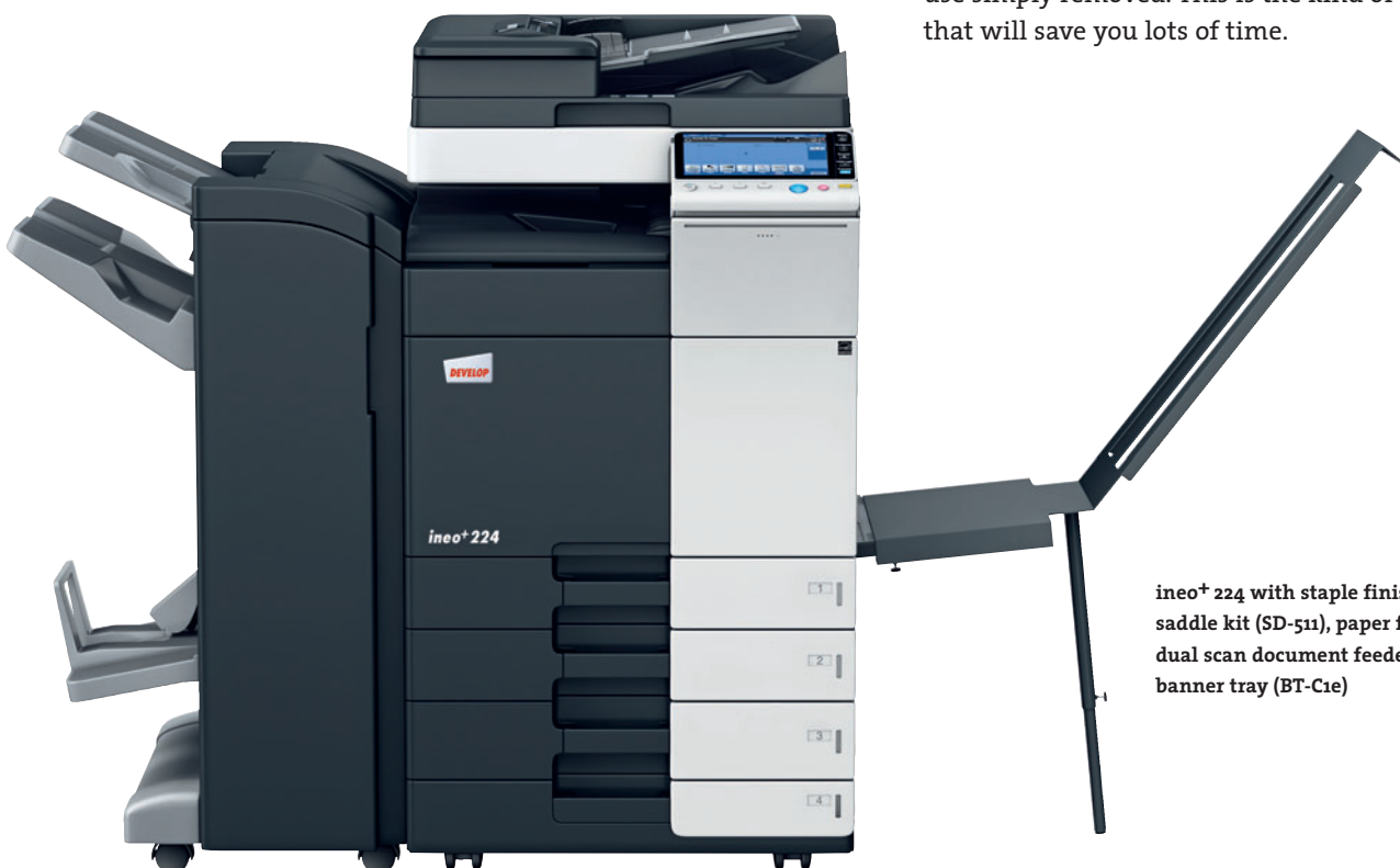
ineo+ 224 with staple finisher (FS-534), saddle kit (SD-511), paper feeder (PC-210), dual scan document feeder (DF-701), banner tray (BT-C1e)

Many multifunctional office systems are anything but user-friendly. The ineo+ 224, in contrast, is simplicity itself. An intuitive, easily understandable operating concept ensures that it is as easy to use as your smartphone or tablet. The 9-inch capacitive touchscreen comes with well-known functions such as flick&drag, and thanks to a new menu navigation structure you can see all functions in one go and select the settings you want with just a few clicks. Frequently used functions can be left on the start screen and ones you don't use simply removed. This is the kind of customisation that will save you lots of time.