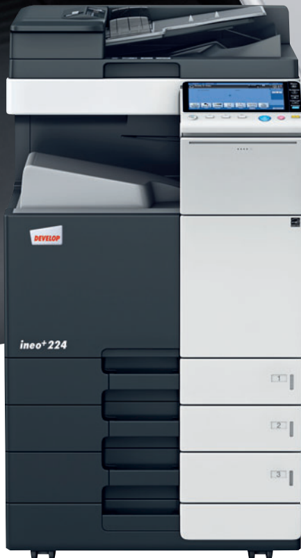
ineo+ 224 with paper feeder (PC-110) and dual scan document feeder (DF-701)